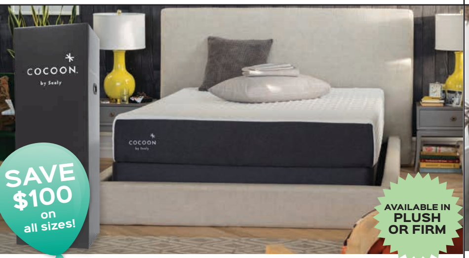
SEALY COCOON | MATTRESS IN A BOX starting from